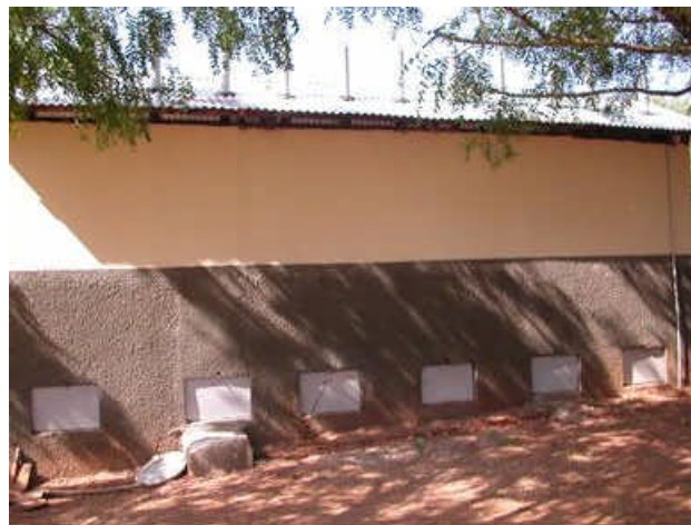
Picture 3 / 4: Reconstructed composting toilet for patient attendants.